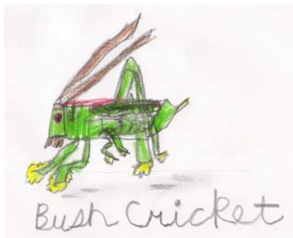
Artist: Sage Gilleland, age 10