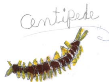
Artist: Sage Gilleland, age 10