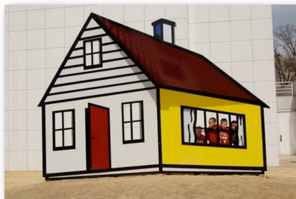
At the Woodruff Arts Center, fooling around before Go Dog Go!