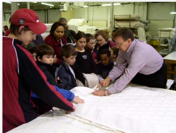
Touring the Original Mattress Factory