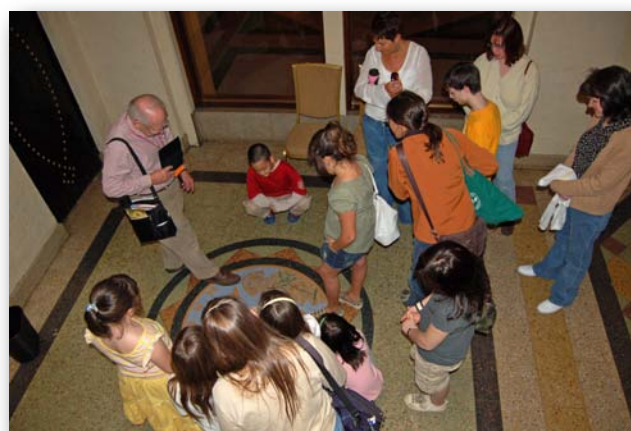
Touring the Fox Theatre, examining the intricate mosaic in the floor.