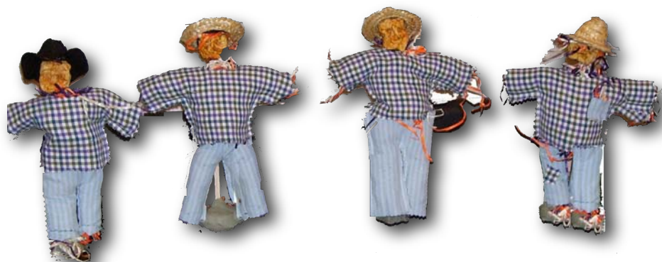
Scarecrows made in our Enrichment Program from dehydrated apples!

The place to share your creative creations.