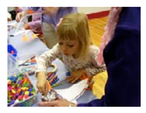
Making puppets after watching Aesop's Fables at the Center for Puppetry Arts